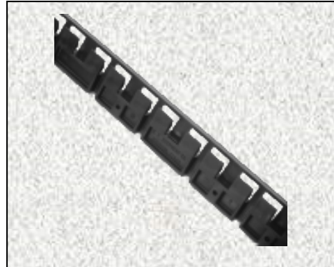
CES Fill Hanger Brackets

Since CE Shepherd Gull Wing fill is engineered with solid PVC at wire contact points, fill retainer clips as shown above are not always required. In these cases, an alternate form of securing the fill bars to the wire hanger grids is by use of "Hog Rings". We offer the hog rings in either galvanized or stainless steel