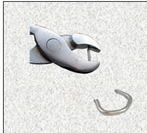
CES Hog Rings and Pliers